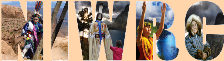
National Indigenous Women's Resource Center